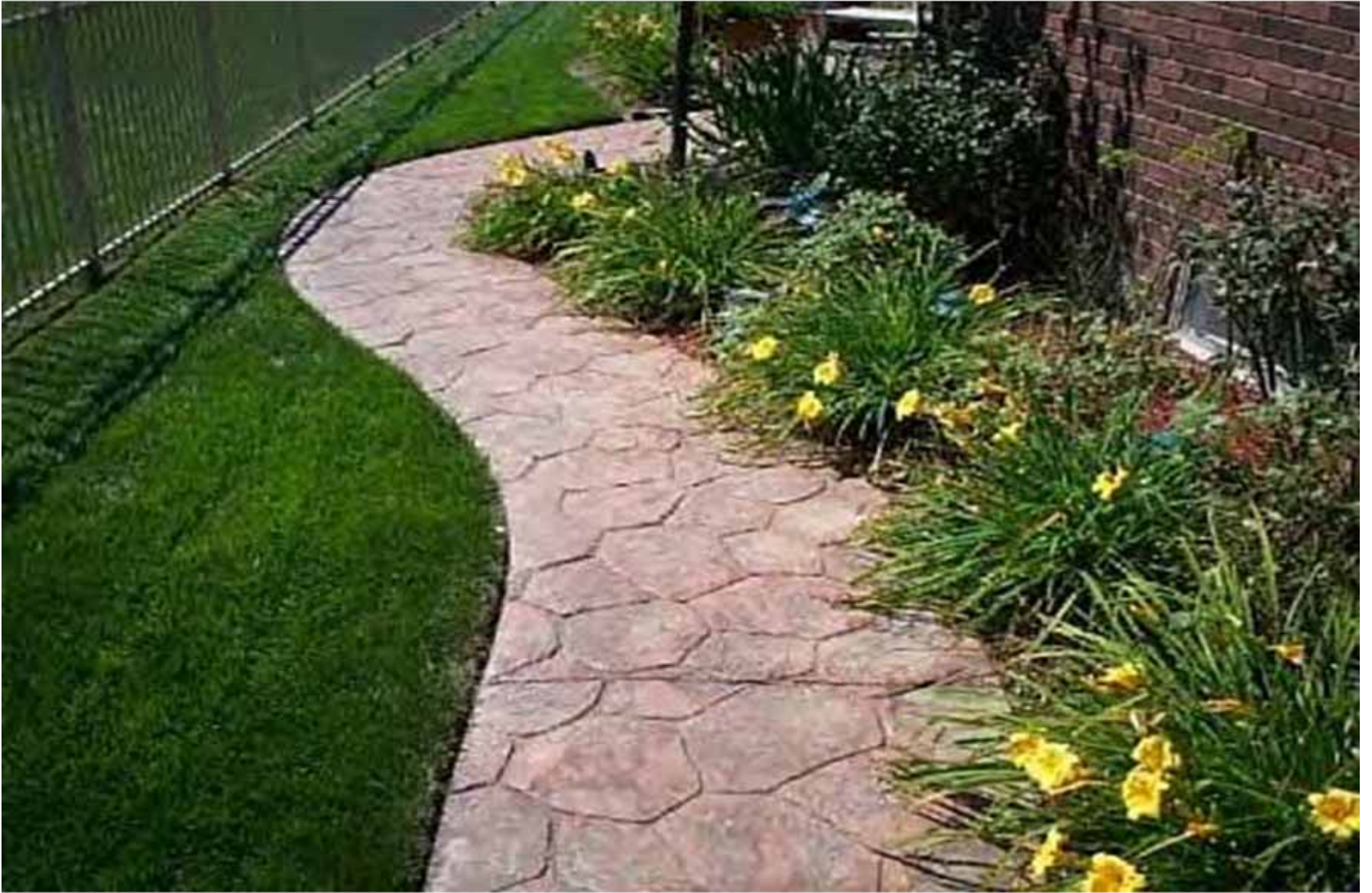
Stamped Concrete Treated with Foxfire 5000WB